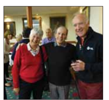
A happy bunch