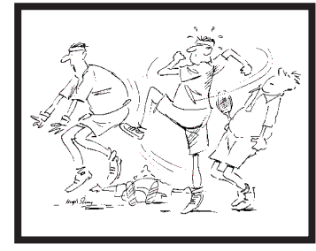
High Knee Kicks